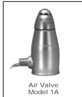
Air Valve Model 1A