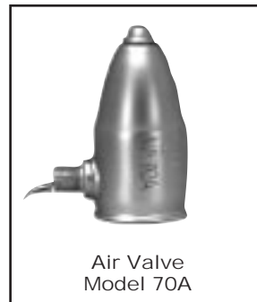
Air Valve Model 70A