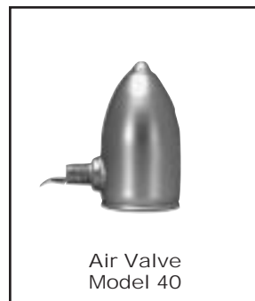
Air Valve Model 40