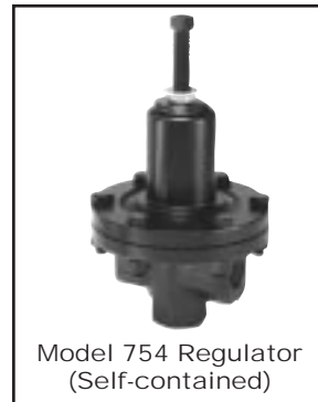
Model 754 Regulator (Self-contained)

Note: Sizing formulas are in accordance with Fluid Controls Institute Standard FCI 62-1.