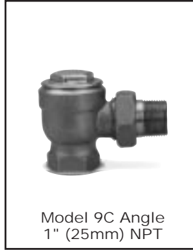
Model 9C Angle 1" (25mm) NPT