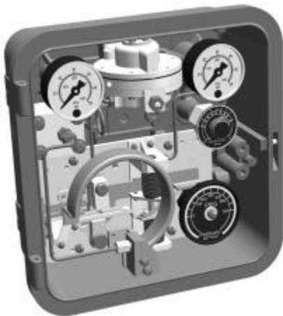
Figure 1. Model 3350 Internals

Actuator Yoke, Actuator Housing, Panel, Surface (Wall), or 2-inch Pipestand