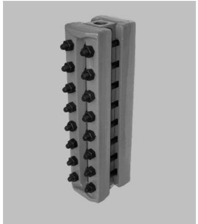
Figure 2. Model 3520, Transparent Style Gauge Glass