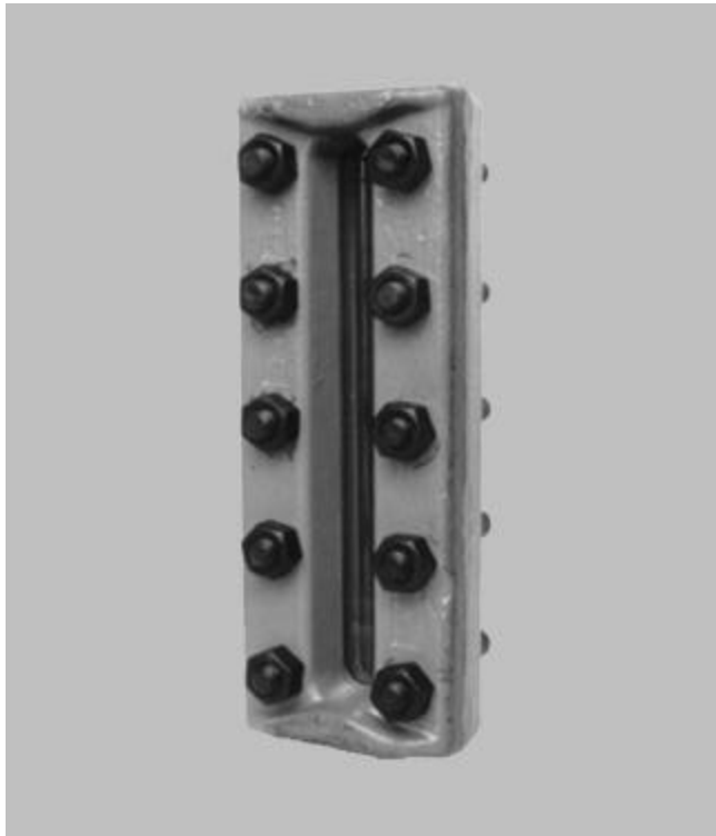
Figure 1. Model 3520, Reflex Style Gauge Glass